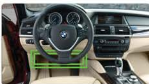
common location of OBD connectors

Step 1. Locate the OBDII socket. (This location will vary from vehicle to vehicle but generally can be located below the steering column / instrument cluster.)