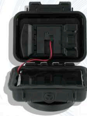
LIVE TRAC PT-10 Pro